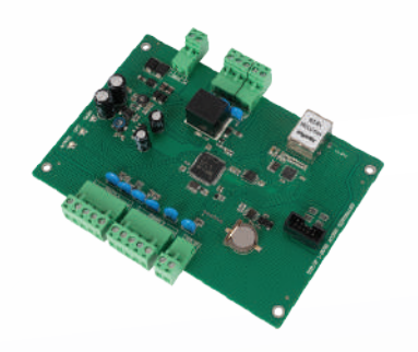
SY-AC1 1 DOOR / 2 READER