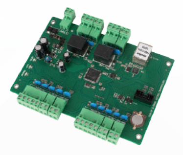
SY-AC2 2 DOOR / 4 READER