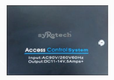
ACCESS CONTROLLER HOUSING SY-H50 / SY-H100