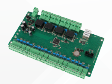
SY-AC4 4 DOOR / 8 READER